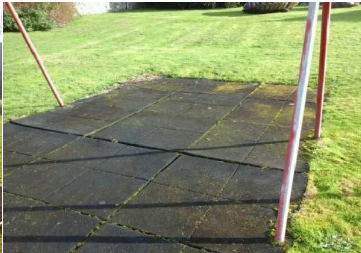
Action: Clean and treat appropriately