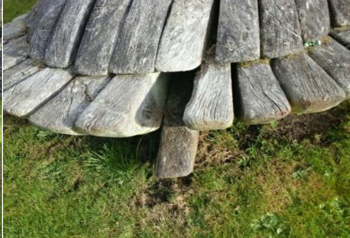
Finding: A timber section has dropped allowing a foot entrapment