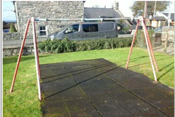
Action: Monitor for any further deterioration and replace as required

Item:Swings - 1 Bay 2 Seat (Cradle)Risk Level:V - Very Low RiskManufacturer:GL JonesSurface:Rubber Tiles