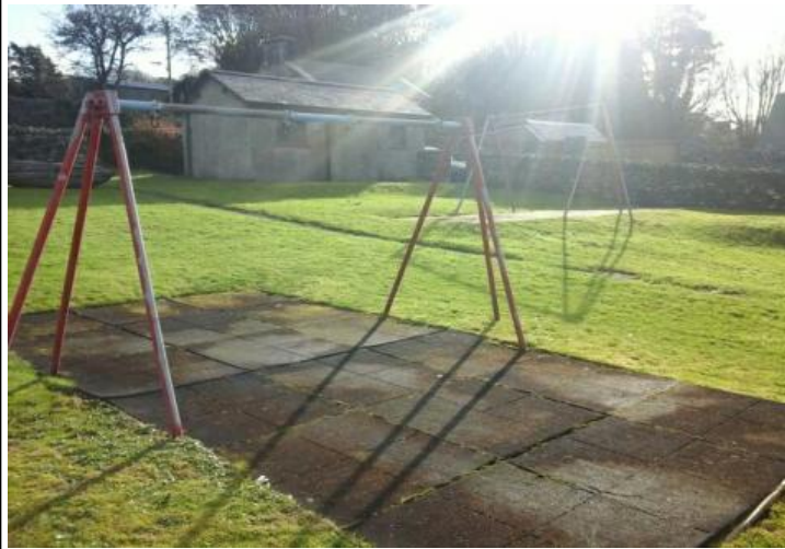
Finding: There is algae or moss growth on the surface resulting in slippery conditions