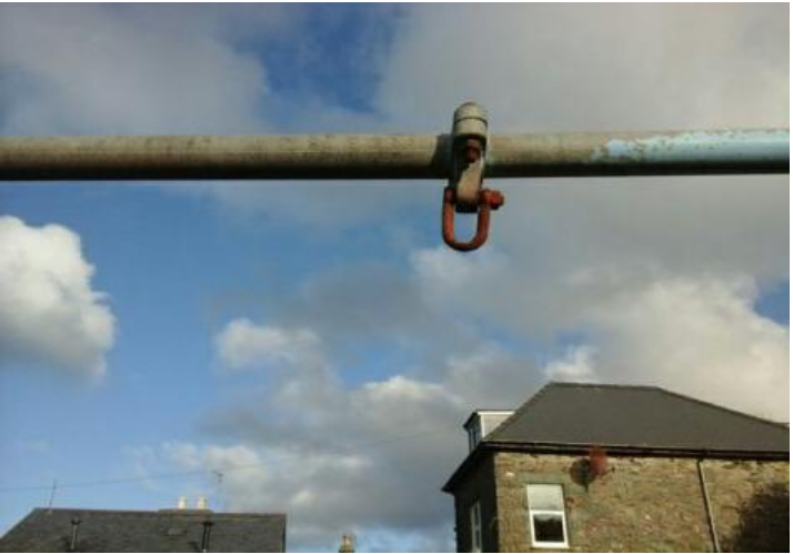
Action: Monitor for any further deterioration and replace as required

Risk Level: V - Very Low Risk Surface: Rubber Tiles