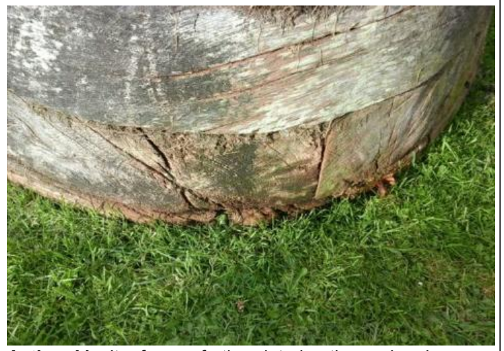
Finding: There is some evidence of rot in the timber