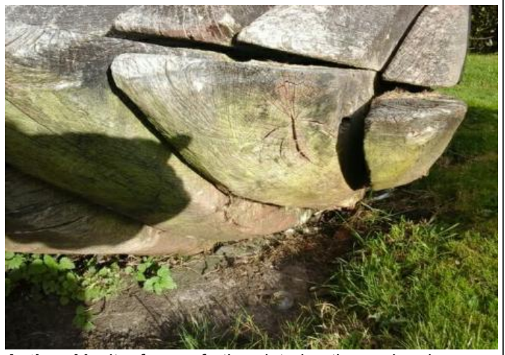
Finding: There is some evidence of rot in the timber