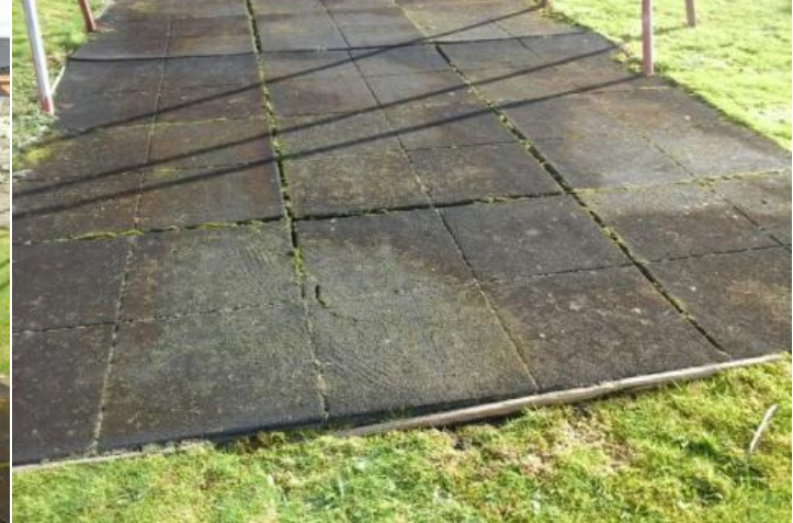
Finding: There are trip hazards at the edges of the surface Action: Reinstate surrounding surface levels to remove the trip points