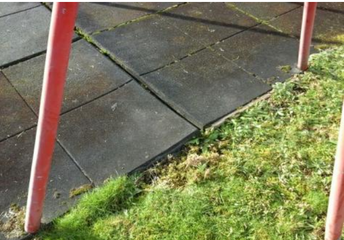
Finding: The tiles can easily be lifted or are lifting along the Action: Lift and re-glue tiles to secure edges of the area