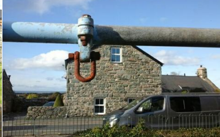
Finding: There is some wear to the shackles.