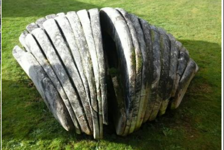
Finding: The item has started to separate resulting in potential entrapments