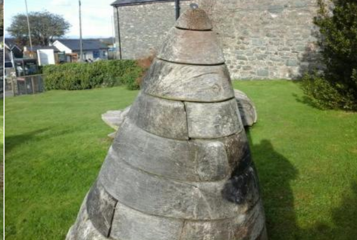
Finding: The top section is loose Action: Secure top section