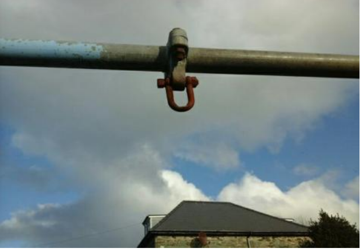
Action: Monitor for any further deterioration and replace as required

Risk Level: L - Low Risk Surface: Rubber Tiles