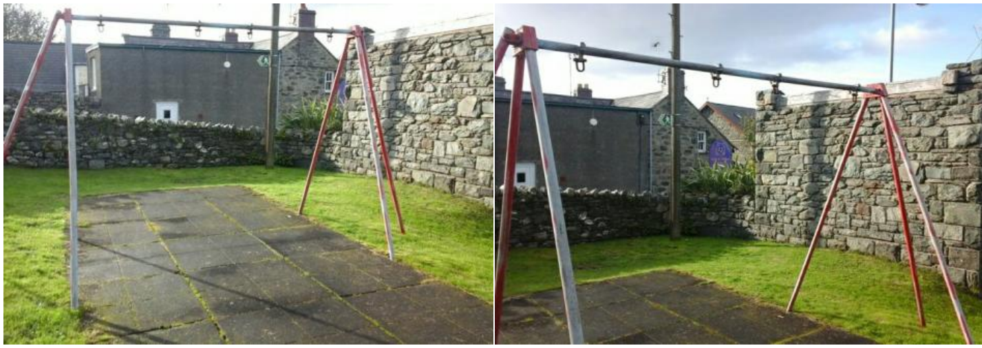
Finding: The seat(s) and suspension were missing at the time of inspection and the inspector was unable to make a full compliance assessment

Manufacturer: GL Jones Surface: Rubber Tiles