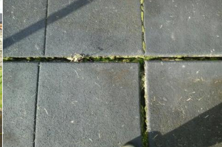
Finding: There are significant gaps (over 30mm) between the surface and the edging or between the joints in the surface; these are large enough for a small foot to enter