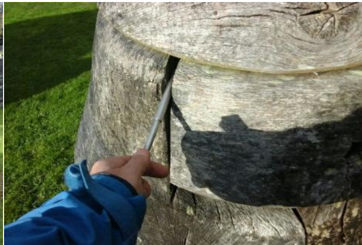
Finding: There is a potential crush point between the rotating sections