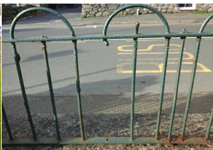
Action: Replace missing slats