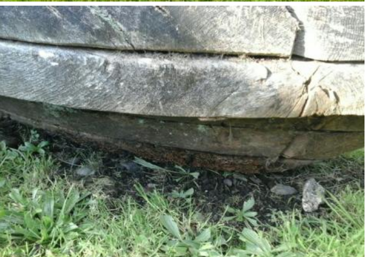
Finding: There is some evidence of rot in the timber