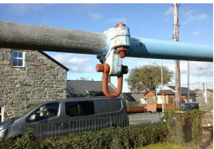
Action: Monitor for any further deterioration and replace as required