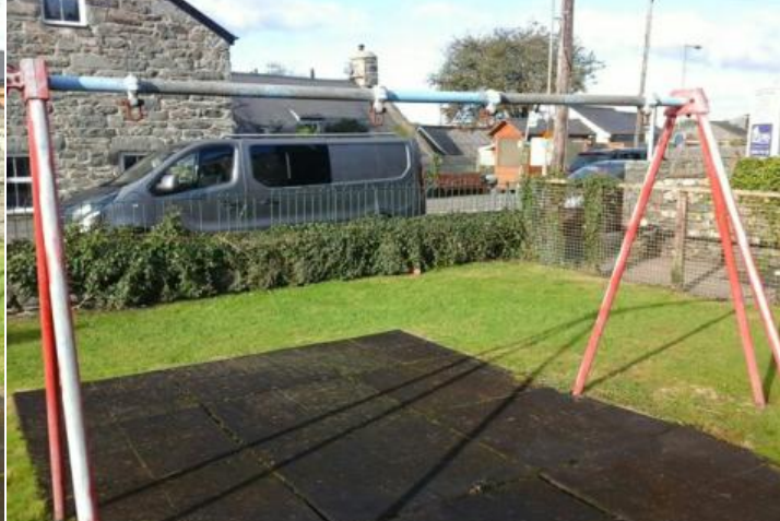
Finding: The seat(s) and suspension were missing at the time of inspection and the inspector was unable to make a full compliance assessment