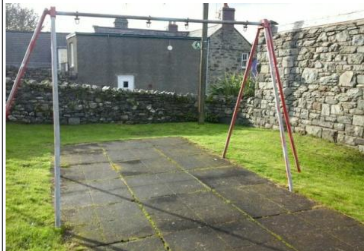
Finding: There are gaps opening in between the tiles

Item:Swings - 1 Bay 2 Seat (Flat)Risk Level:L - Low RiskManufacturer:GL JonesSurface:Rubber Tiles