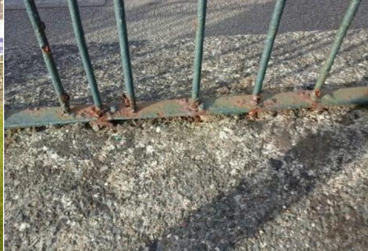
Action: Consider treating and repainting the item