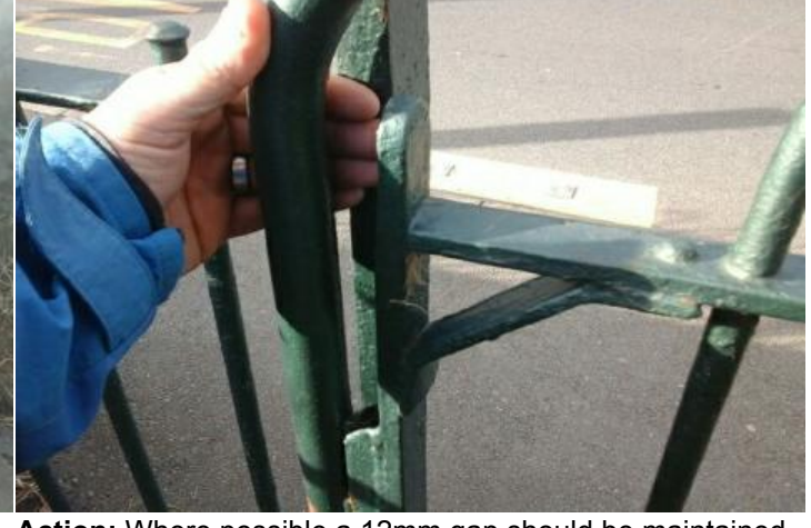
Finding: The opening between the gate and the post or the double gate leafs is less than 12mm and could trap users Action: Where possible a 12mm gap should be maintained on both sides or between the gate leafs of the gate fingers