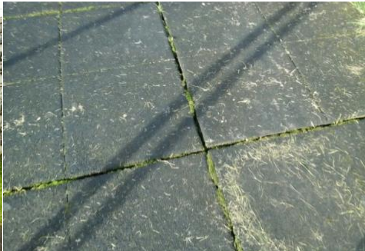
Action: Monitor for any further deterioration and repair as required