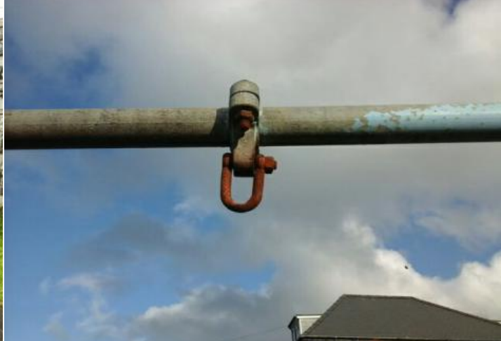
Action: Monitor for any further deterioration and replace when 40% worn

Risk Level: L - Low Risk Surface: Rubber Tiles